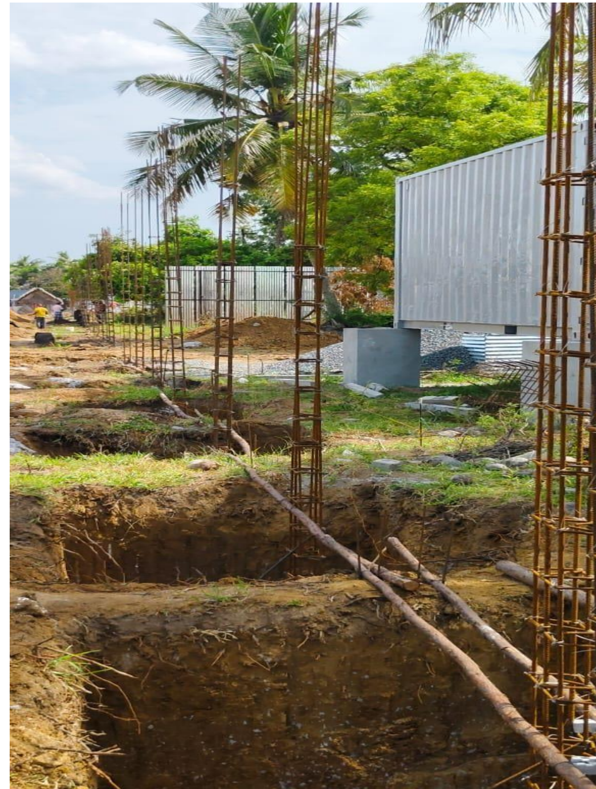
WEST SIDE COMPOUND WALL FOOTING & COLUMN CONCRETE WORK IN PROGRESS